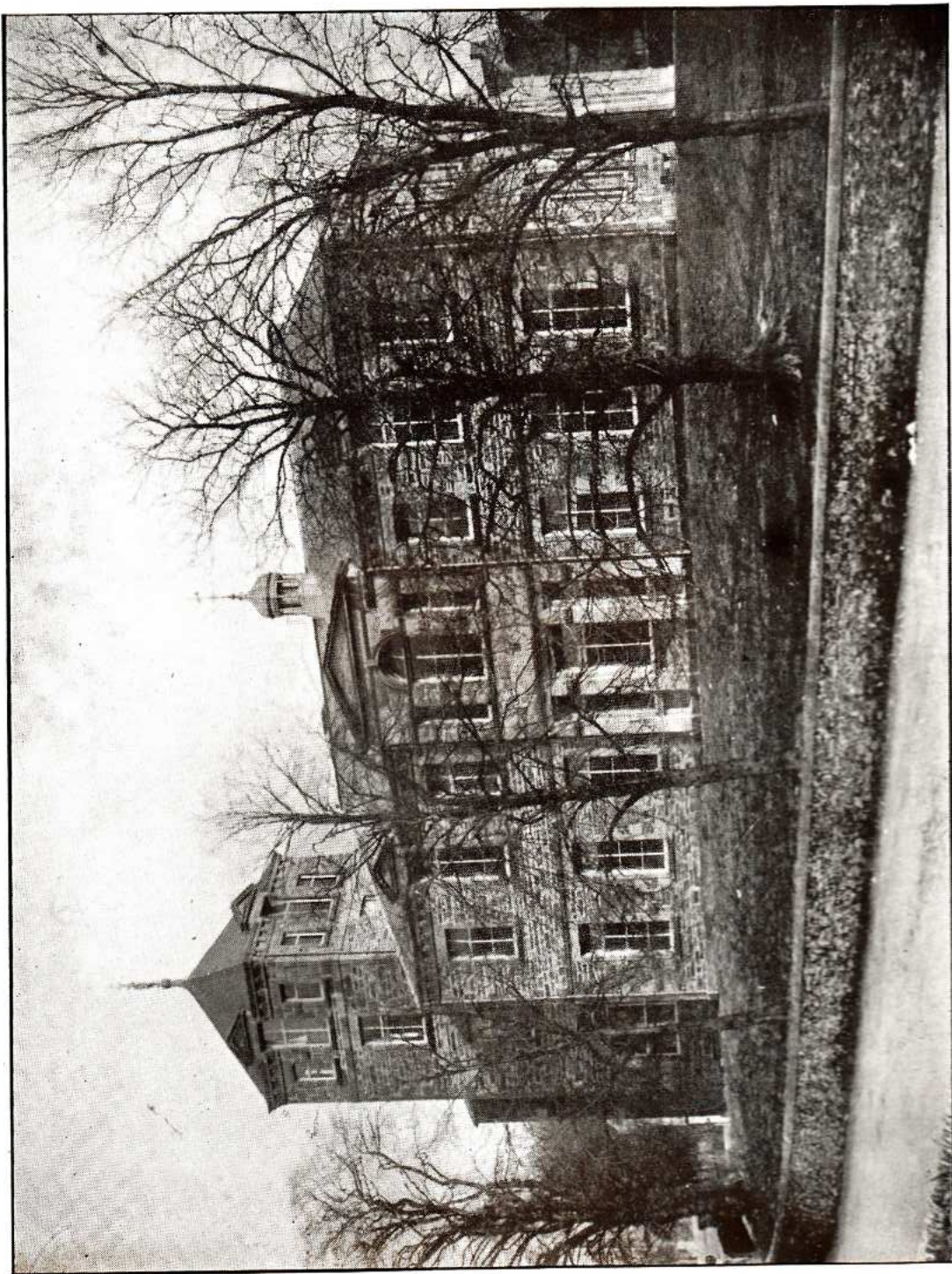
KEITH GRAMMAR SCHOOL.