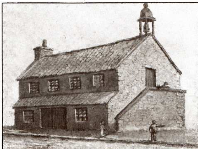
JAIL AND SCHOOLHOUSE.

quate. The situation was not relieved to any appreciable extent when in 1819 a change was made to the upper flat of the jail in the Square. However suitable the