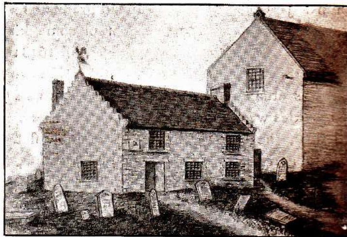
EDINDAICH MORTIFIER'S SCHOOL.